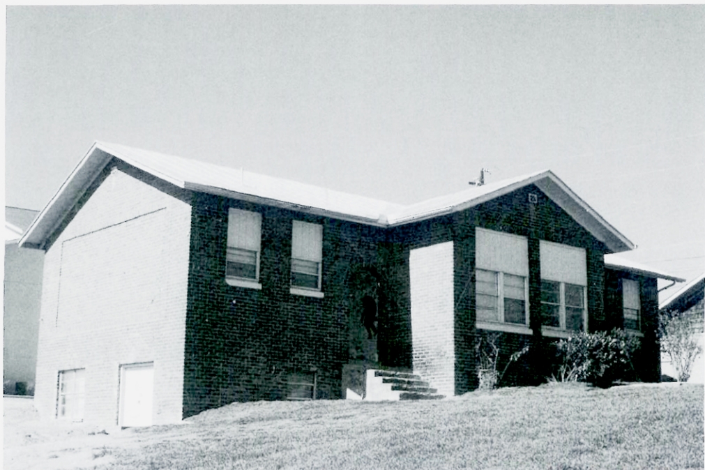
Figure 1-53. The Pleasant View Rosenwald School was built in 1923 near Sevierville and is the county's only example of a Rosenwald-funded school for African Americans.