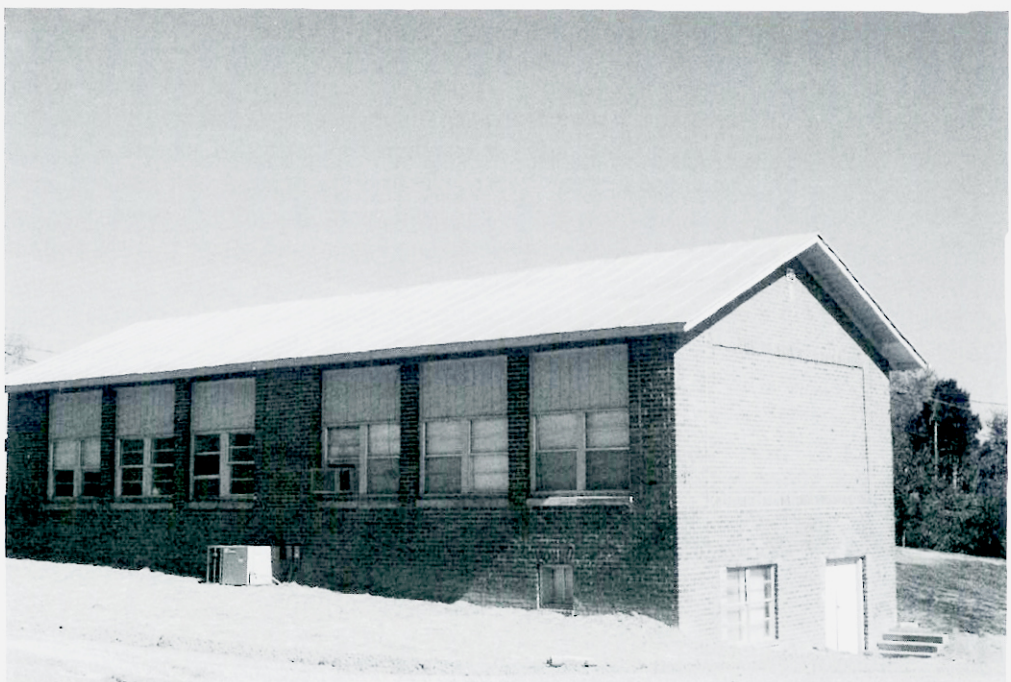
Figure 1-54. The rear facade of the Pleasant View Rosenwald School, which was built by the J, F & N McMahan Construction Company with donated labor and materials.